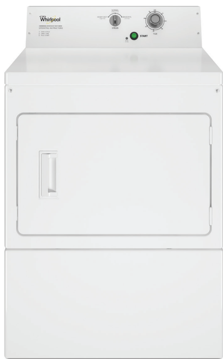
CEM2795JQ / CGM2795JQ

Why Buy: Choose a commercial-built product that withstands heavy traffic, regular use, and performs continuously.