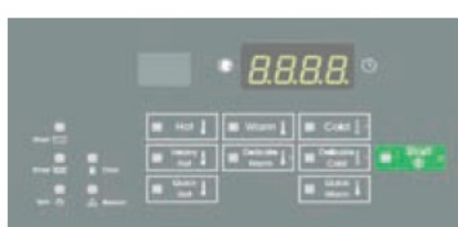
Galaxy 400 (G400)