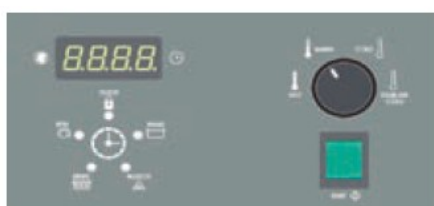
Galaxy 200 (G200)