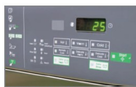
Galaxy 600 (G600)