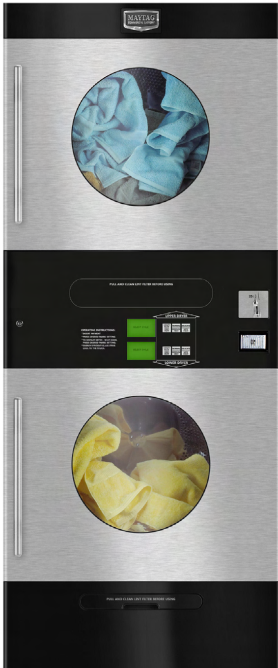
Shown in Stainless Steel.